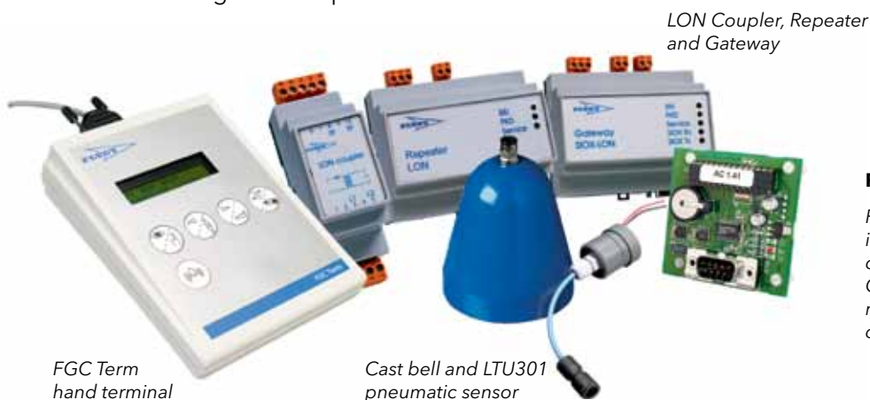
FGC Term hand terminal

No one knows your stations better than you. Choose from a long list of helpful accessories.