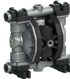
ALU (P 100)