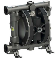
SS (P 100)